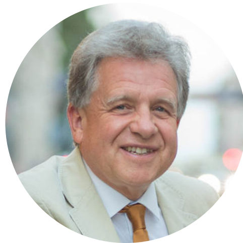
Founder & CEO